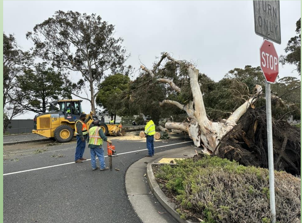
A downed Eucalyptus blocks Hilltop Drive